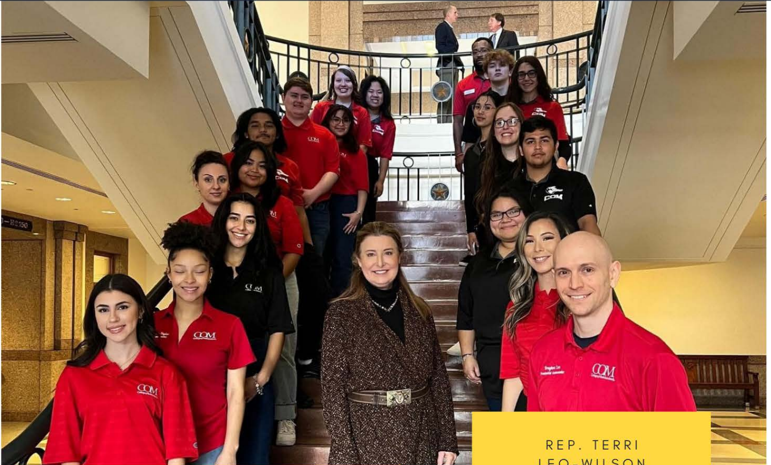
REP. TERRI LEO-WILSON