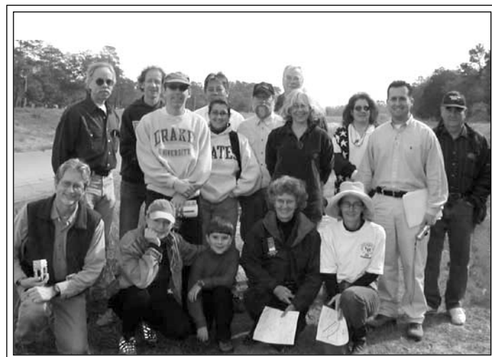
Touring White Oak Bayou with constituents to discuss flooding issues.