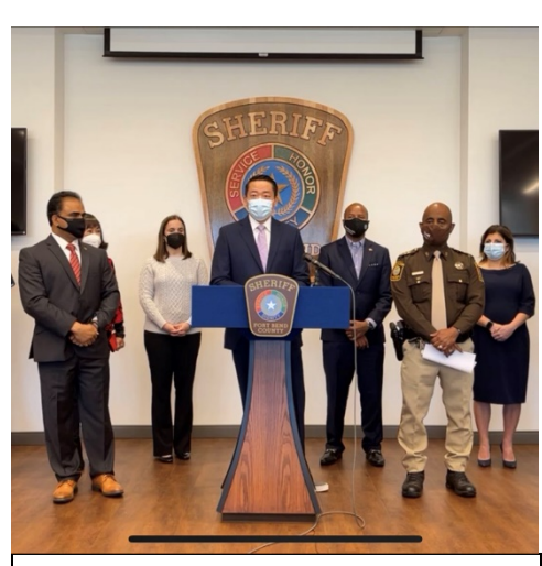
Rep. Wu Speaking at a Stop Asian Hate press conference