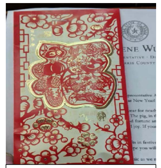
Giving red envelopes filled with money is a Lunar New Year tradition to symbolize good wishes and good luck.

This February 12th was Lunar New Year and marks the beginning of the Year of the Ox. Lunar New Year, also called Spring Festival is typically celebrated in China and other Asian countries beginning with the first new moon of the lunar calendar.