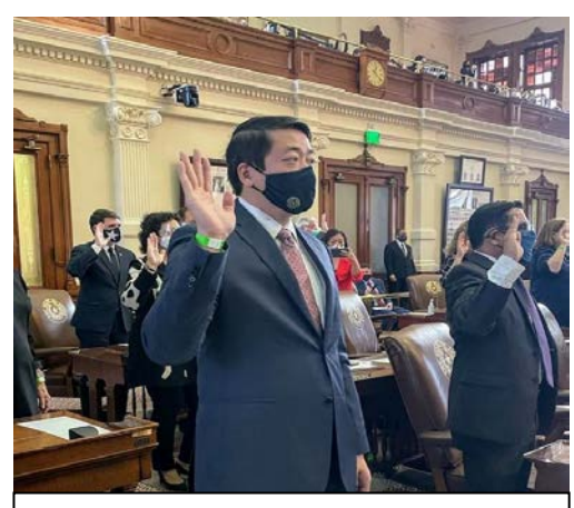
Representative Wu being sworn in on the first day of the 87th Legislative Session.