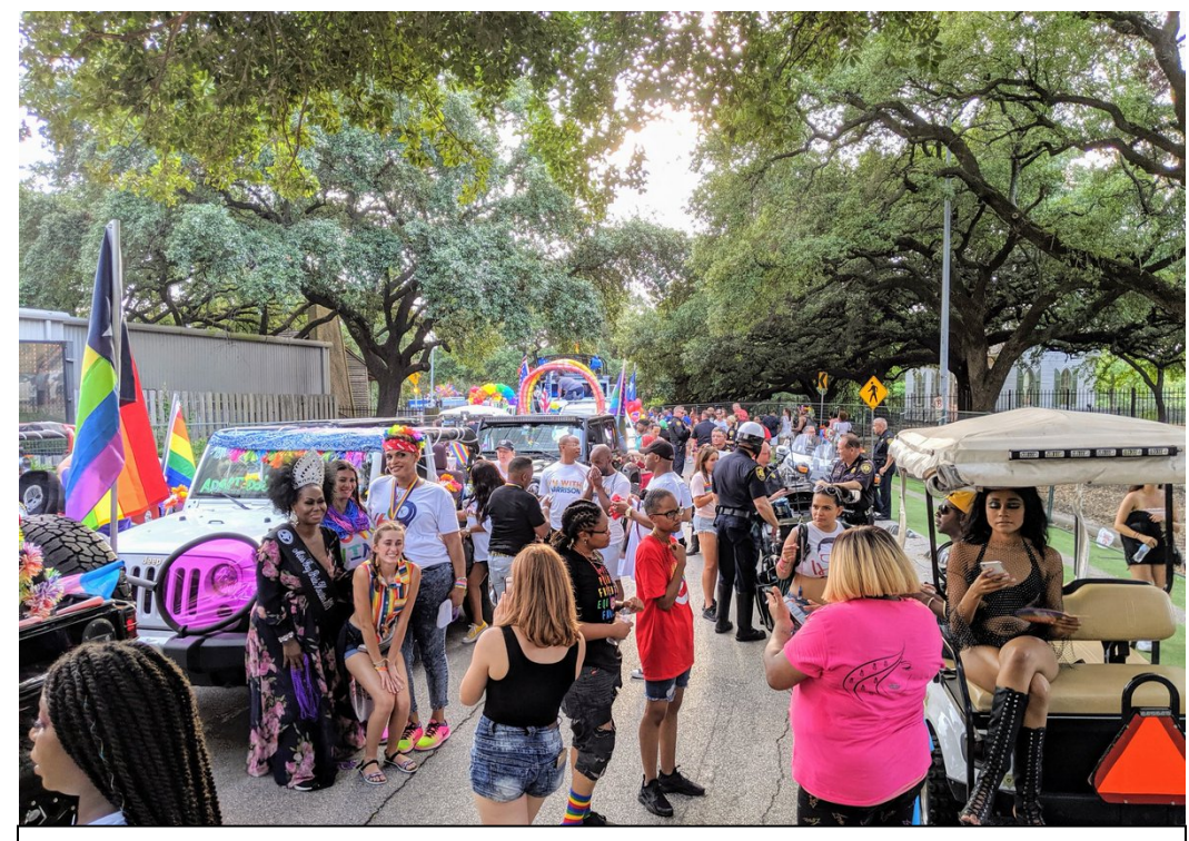
The Houston Pride Parade started on Allen Pkwy and marched through downtown to city hall

This month our city held the annual Pride Parade celebrating our LGBTQ community.