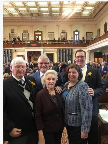
Rep. Huberty with family on the House Floor