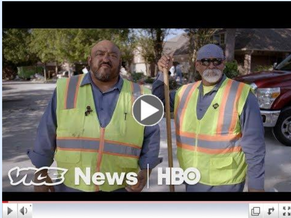
Texas' Garbagemen Are Coming To Save Houston

Though the historic floods caused by Hurricane Harvey have receded, the piles of trash and debris deposited on residential streets throughout Houston have not. And with local landfills doubled in volume, the city found itself in need of help from neighboring cities.