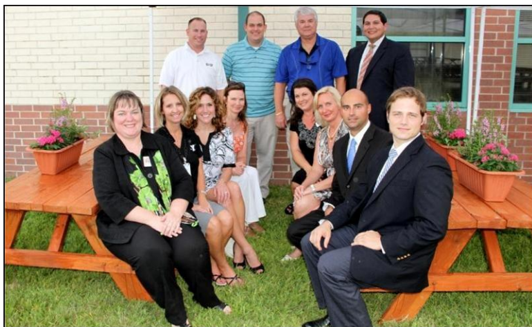
Members of the 2012 Class of Leadership Lake Houston

The IB Primary Years Programme, as it is called by the IB system, for students aged 3 to 12, focuses on the development of the whole child as an inquirer, both in the classroom and in the world outside. Humble High School is also an IB school, for the Middle Years Programme.