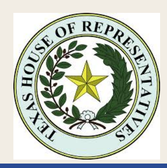
District 126 News and Information