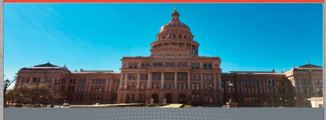
Texas House of Representatives