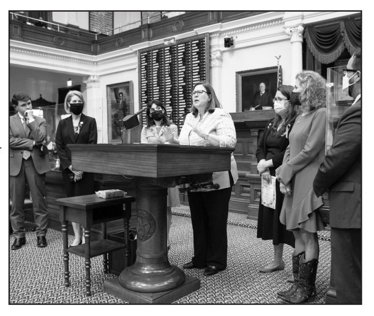
Debating legislation on the House floor.

This session I filed numerous bills to increase access to care for those with special needs and disabilities. HB 440 would give the patient the choice to purchase a more expensive hearing aid or cochlear implant with better technology than the plan allows – but pay the increased cost themselves. HB 2984 would increase access to treatment for autism by raising the age of when the diagnosis occurred in order to qualify for treatment from 10 to 22 years of age.