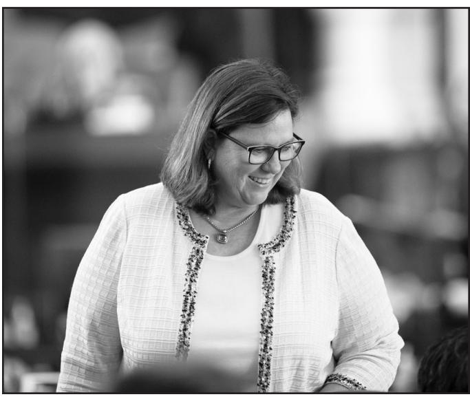
Visiting with members on the House floor.

Prior authorization requires a physician to obtain approval of the medical necessity and appropriateness of a health care service before it is provided. This is a burdensome process that can oftentimes create a block to care and limit access to timely medications. Lawmakers heard from doctors, organizations, and patients who testified in favor of our bills - House Bill 410 and House Bill 907-which would have alleviated some prior authorization requirements and made access to health care easier for many Texans. While our bills did not pass, this was a very important step in beginning the conversation around access to care and the roadblocks Texans face. HB 907 specifically would limit prior authorizations to once a year for the medications of individuals with autoimmune diseases, including prescription drugs used to manage or treat type I diabetes and rheumatoid arthritis.