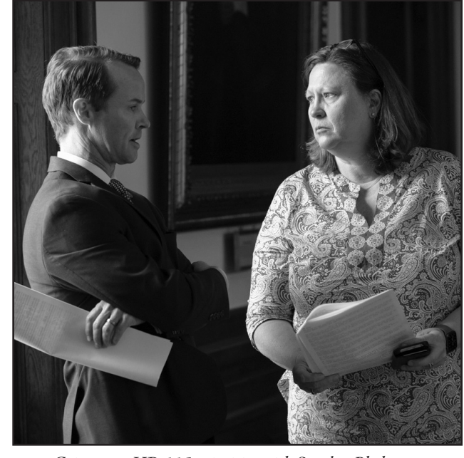
Going over HD 115 priorities with Speaker Phelan.