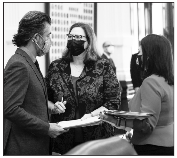
Strategizing with Rep. Ramos and Rep. Romero.

This session was unique for Texas in the fact that there were many long-standing health needs, such as leading the nation in uninsured among children and adults, which needed desperate attention in addition to the immediate needs from the pandemic, e.g., utilization of masks, PPE equipment, and vaccinations. The pandemic brought about unprecedented challenges to our state, and this session there were several pieces of legislation that will protect our economy and Texans. There is still much work to be done as we assess the long-term impacts of COVID-19, and I remain committed more than ever to addressing these pressing needs in future sessions.