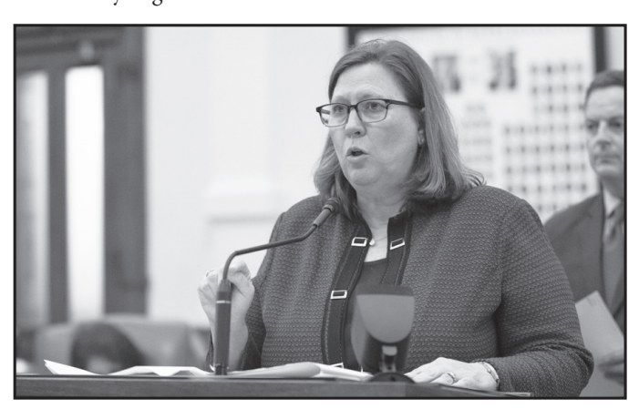
Debating legislation on the House floor.

One victory for our local HD 115 cities was the defeat of HB 4072 by Rep. Morgan Meyer. This bill proposed changing local sales tax sourcing laws from "origin" to "destination" sourcing. HB 4072 would have invalidated countless local government multi-year incentive agreements resulting in significant revenue loss to Texas businesses without any study to assess the bill's impact. This bill would have devastated many of the HD 115's local governments and their ability to govern.