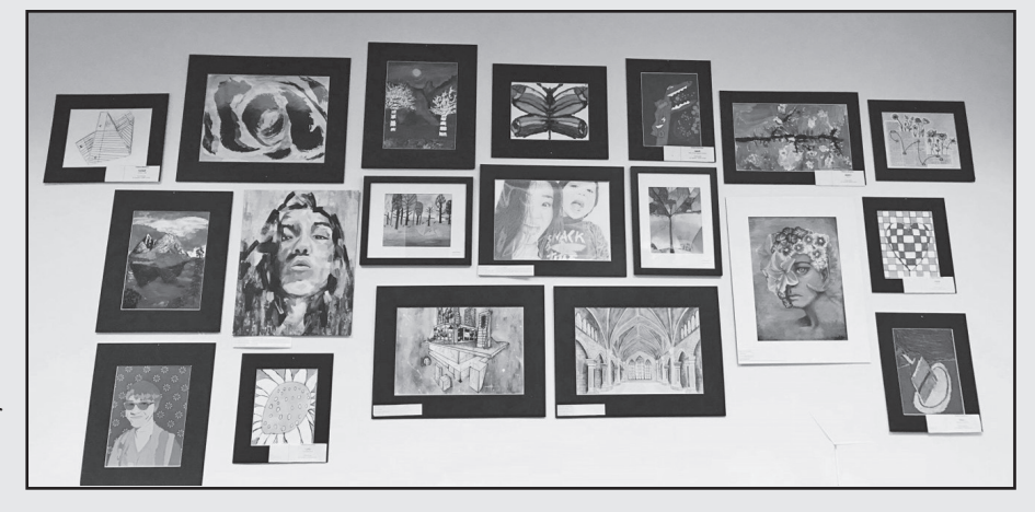
HD 115 student art work wall

We were also able to spotlight District 115 in a unique way in our Capitol office by displaying beautiful artwork by students from the Coppell and Carrollton- Farmers Branch school districts. The arts encourage essential skills needed for a student's development and increases their well-being leading to a more engaged learning experience. As a supporter of the arts in our schools, I was honored to showcase the talents of my young constituents to every visitor we hosted.