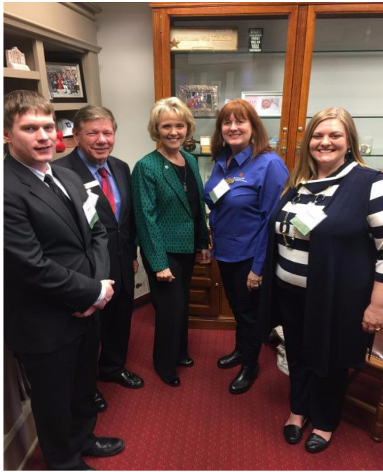
Fantastic meeting with the Garland Park Board.