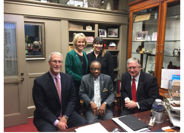
Meeting with the City of Garland. Happy to work together for our community.