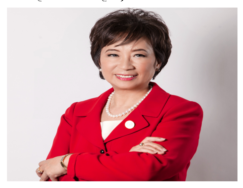
February 15, 2019