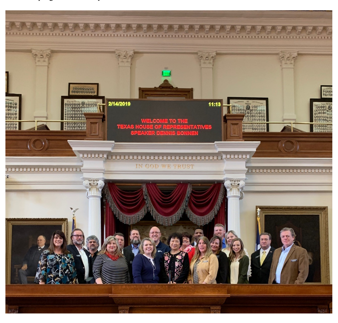
Wednesday was Sachse Day at the Capitol! I am proud to have these fine community leaders from home here in Austin to help educate my colleagues about our wonderful community and the issues that are important to Sachse.

Our last testimonies came from the University of Texas System, Texas A&M University System, and East Texas Baptist University regarding what the different universities are doing to ensure compliance with Title IX. Title IX is a federal act ensuring equal opportunity for all sexes in any educational program or activity.