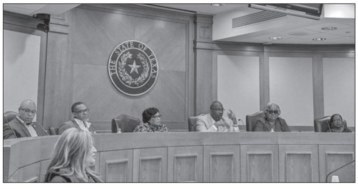
Representative Rose and members of the Texas Legislative Black Caucus meet with Texas Education Agency Commissioner Mike Morath regarding solutions to eliminate the achievement gap for African American Students.