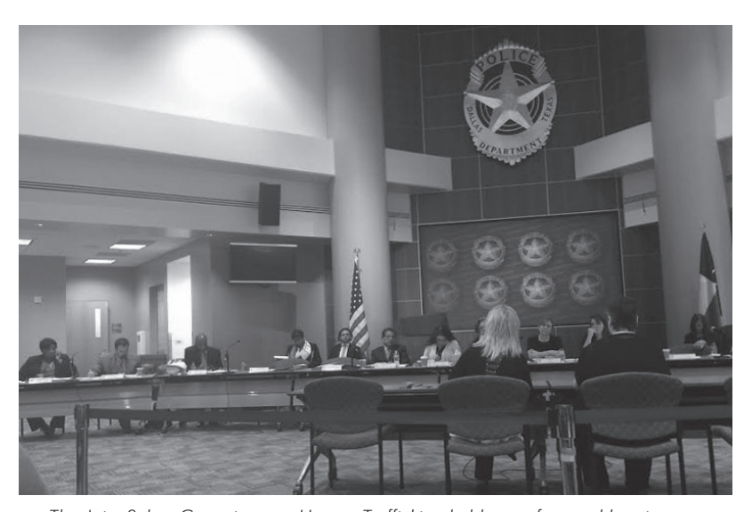
The Joint Select Committee on Human Trafficking held one of several hearings to learn more about this issue in Dallas, TX on September 25, 2014.

The legislature will also look at raising the age of juvenile jurisdiction from 17 to 18 years of age. This change would mean that 18 years of age would become the age in which a person may be charged as an adult for a criminal offense. Deciding whether to