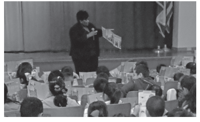
John Runyon Elementary students were amazed by all the facts the representative shared about the state of Texas.