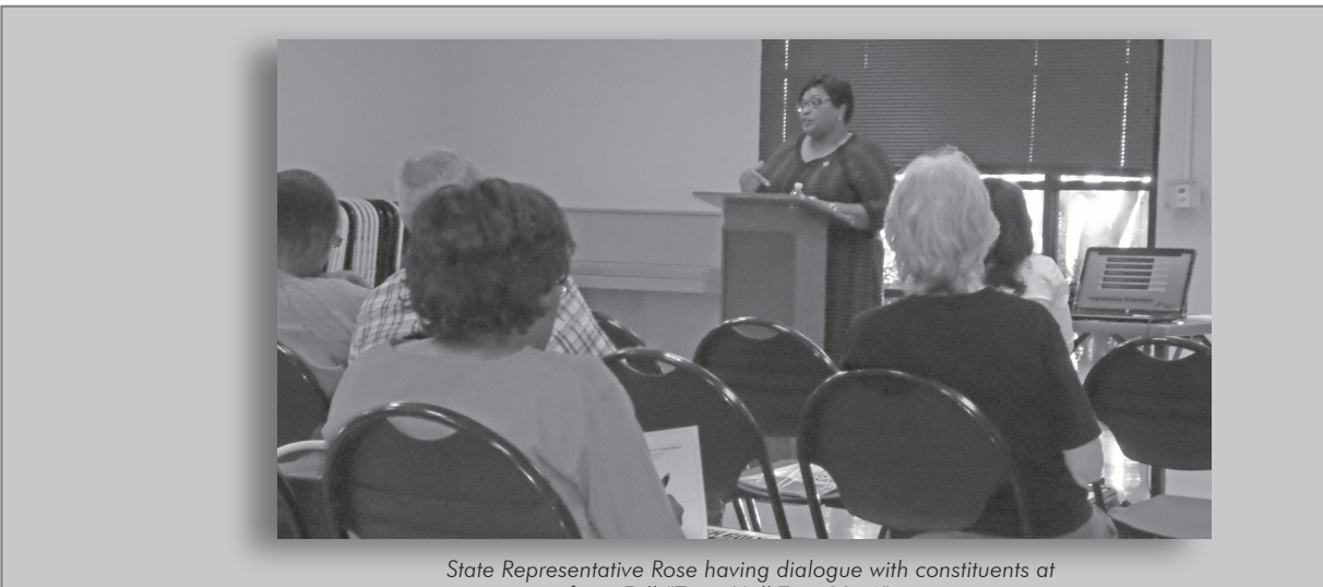
one of two Fall "Town Hall Tour 2014" meetings.

If you or someone you know is interested in being an Honorary Page during the 84th Legislative Session, please contact our offices for more details.