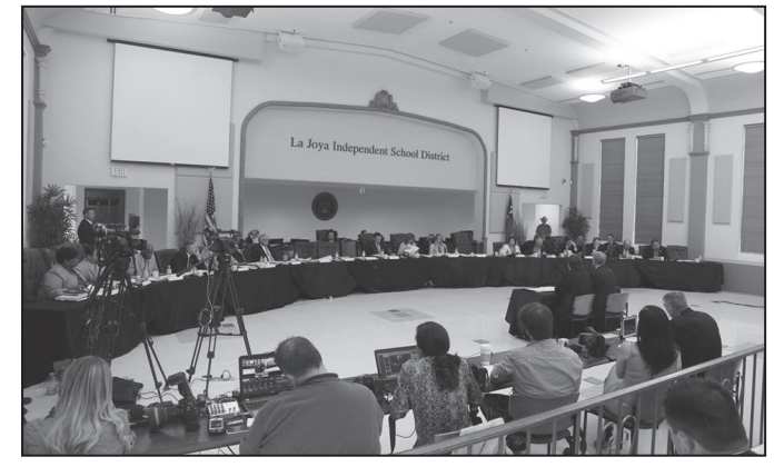
Members of the Joint Committee on Human Trafficking gather in McAllen to hear testimony from state agencies and constituents regarding this growing issue.

The House Select Committee on Child Protection is charged with studying the incidence of abuse and fatalities related to neglect in Texas and making recommendations to protect children. The select committee will also partner with the public members of the Protect our Kids Commission, which the Legislature created in 2012. The approximation will produce the protect of the legislature created in 2013.