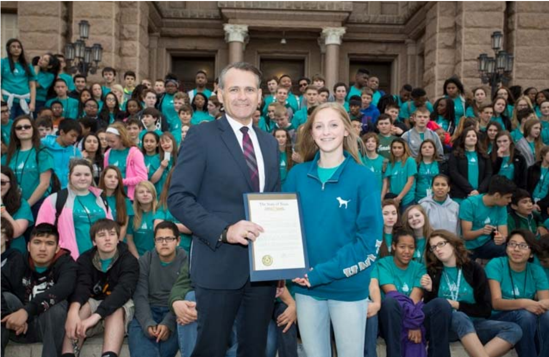
Recognizing the Howard Students with Purpose at the Capitol