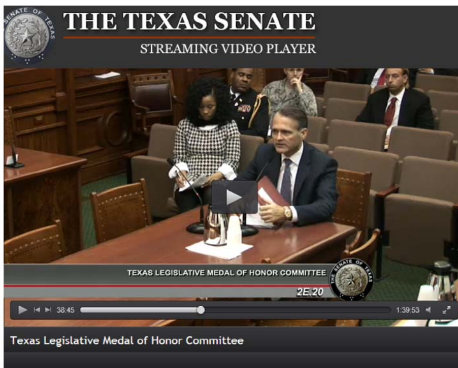
Testifying on behalf of Chris Kyle