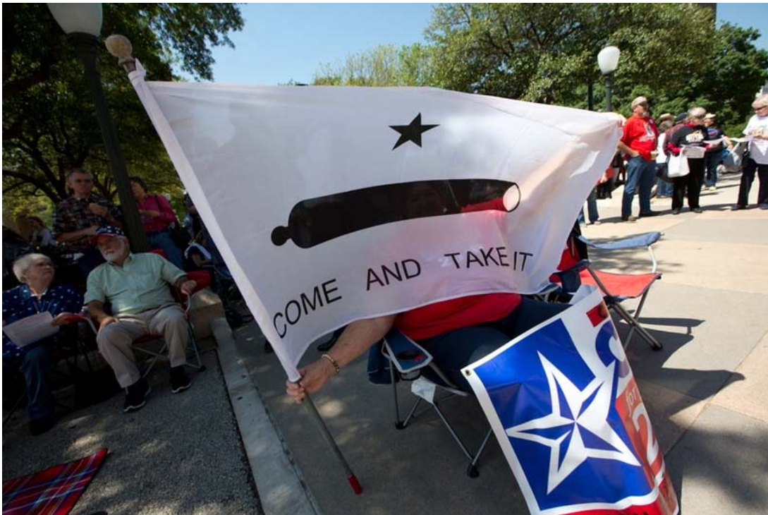
Texas Tea Party Day at the State Capitol

The first ever statewide Texas Tax Day Tea Party Rally was held on Wednesday at the Capitol. Over 100 activists gathered on the south steps of the Capitol to celebrate their grassroots accomplishments and inspire citizens to be more involved in the political process. It was a privilege to meet with Tea Party constituents who made the trip down to Austin. The Tea Party movement is vibrant in Texas and I appreciate all the hard work members put in to bring a conservative message to citizens across the state.