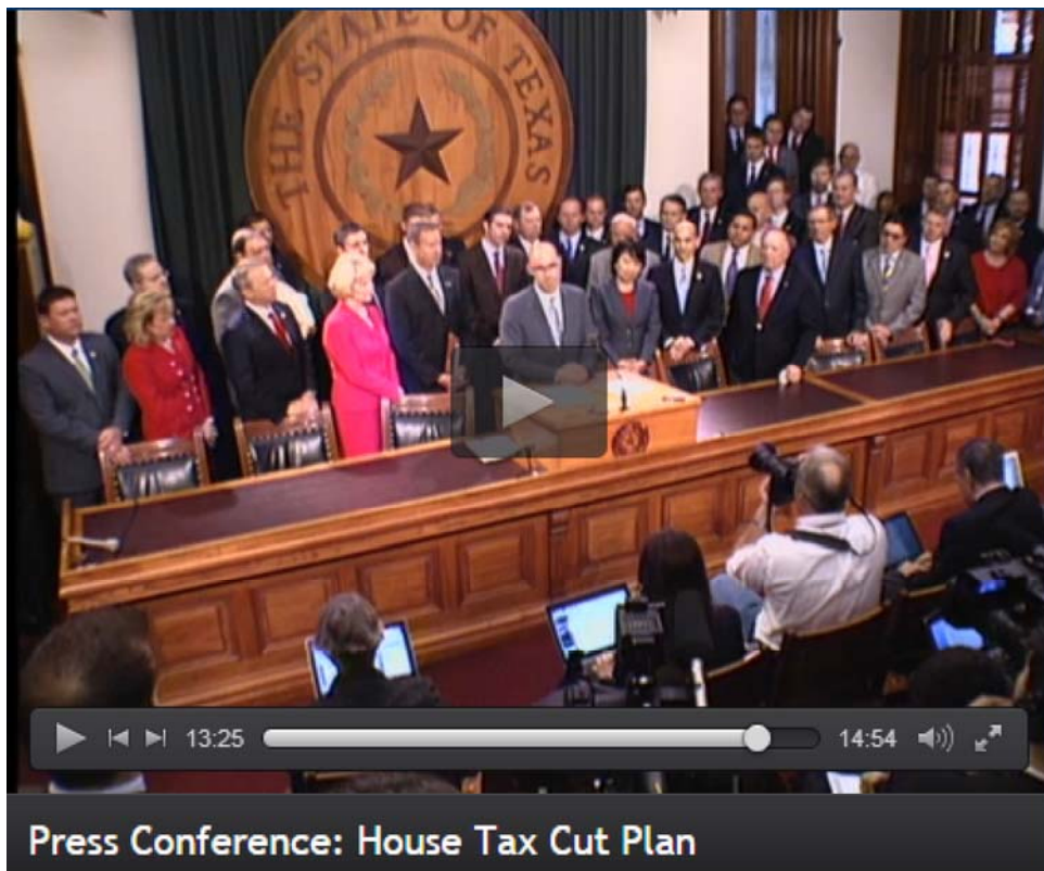
House Press Conference on Tax Relief