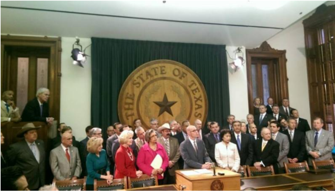
My House colleagues and I gather for the HB11 Press Conference