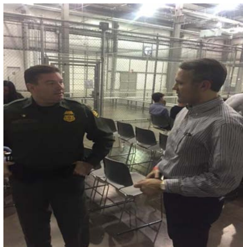
Border Patrol Officer

Last month, I had the opportunity to visit the Rio Grande Valley with several other members and legislative staff to see some of the challenges and successes of the region, including border security and economic development. I am thankful to gather this information first hand as I work to find solutions to some of the most pressing issues facing our district and state.