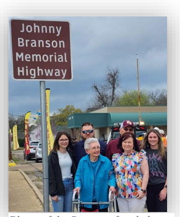
Photo of the Branson family by Susan Lindsey, Bowie County Citizens Tribune.

Mayor Branson honored. In June 2023, the New Boston City Council unanimously passed a resolution designating U.S. Highway 82 from Elm Street to the western city limits as the "Johnny