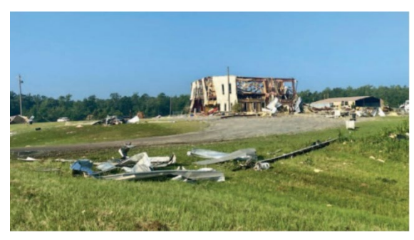
Tornado damage in Cass County.

Severe storms in Northeast Texas. Areas of Northeast Texas have recently been impacted by severe storms with tornadoes, heavy rain, hail, damaging winds and lengthy power outages. Over 200,000 electric customers were without power after the storm's initial assault on the area. Electrical line workers from utility companies and electric co-ops have been joined by workers from other states sent to help restore power and replace destroyed and damaged poles, lines and equipment. Losing power at any time is a major challenge but