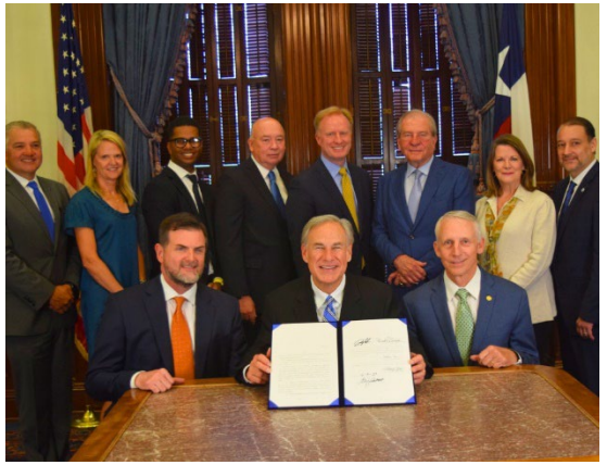
Governor Abbott signed HB 8 on June 9, 2023.