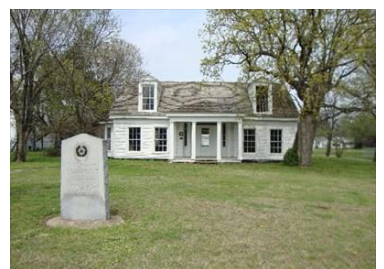
The DeMorse Home, Clarksville, Texas.

Historic preservation in Clarksville. In the 2024-25 budget there are two miscellaneous provisions associated with the Texas Historical Commission (THC) on page IX-112 in Sec. 17.21, subsections (c) and (d) for the Lennox Home and DeMorse Home in Clarksville. These two subsections provide a $1 million grant for each home for preservation efforts.