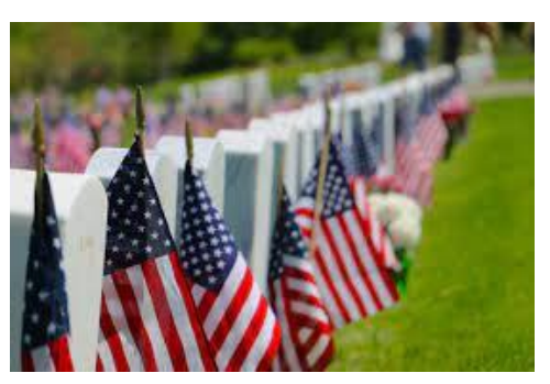
The United States National Cemetery.

Memorial Day. Originally called, "Decoration Day." In 1869, the head of an organization of Union veterans, Major General John A. Logan, established Decoration Day as a way for the nation to honor the graves of those who died in the Civil War with flowers, according to the U.S. Department of Veterans Affairs.