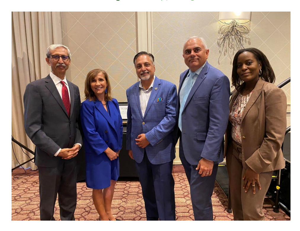
Indus Hospital Houston Gala September 9, 2023

Mental Health America of Greater Houston's Tackling Suicide Luncheon September 7, 2023