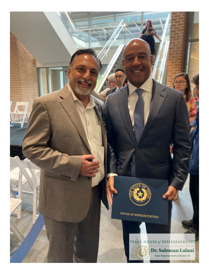
Faris Foundation "Let There Be Gold" Community Event September 14, 2023