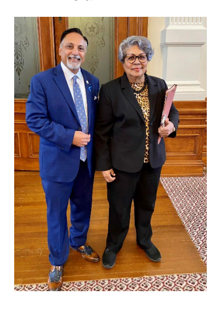
HB 54. On Tuesday, the House passed HB 54, which increases the amount of social security

Unlike some proponents of HB 2127, I am a genuine advocate of local control. The communities of HD 76 know our needs and interests better than outsider politicians, many of whom have never even visited our district. I am joining with many representatives from Texas cities, large and small, to stop harmful legislation like this. We must do everything possible to minimize the harm it will inflict upon tens of millions of Texans. Texans have a right to local government that is allowed to serve their residents' interests.