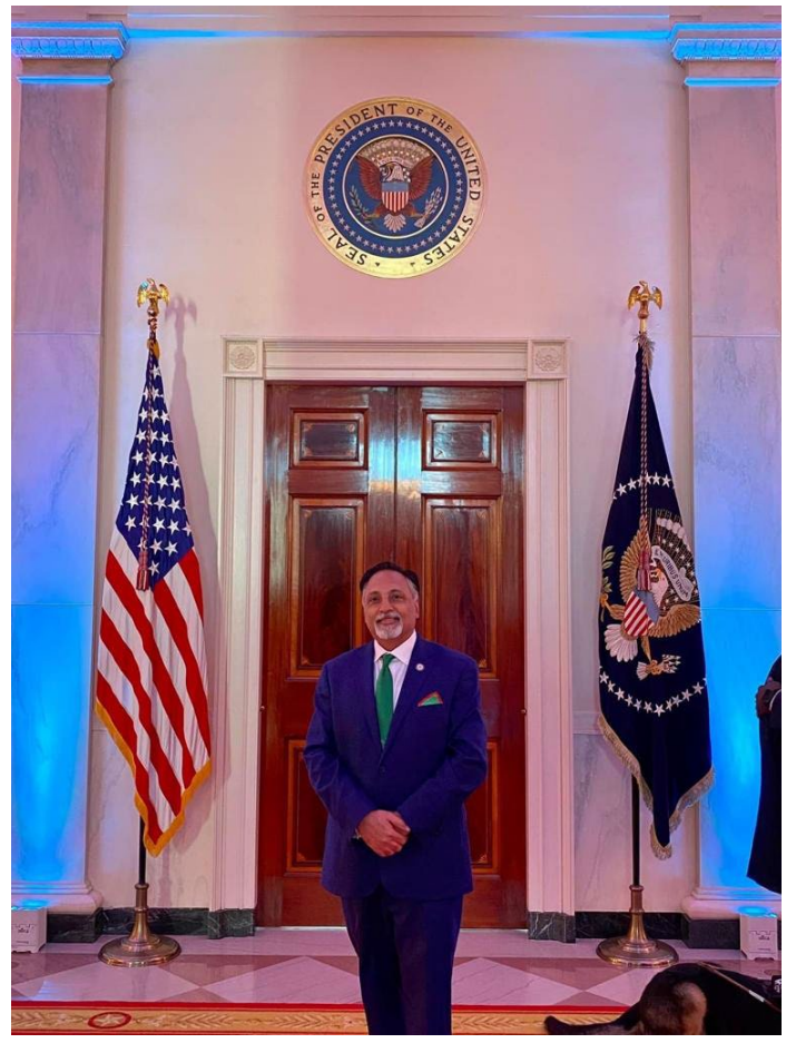
HR 581: Pakistan Day Recognition: As a Texan of Pakistani origin, it was an honor to author House Resolution (HR 581) commemorating Pakistan Day on March 23, 2023. The day celebrates the adoption of the Lahore Resolution by the Muslim League at the Minar-e-Pakistan (lit. Pakistan Tower) which called for the creation of an independent sovereign state derived from the provinces with Muslim majorities located in the North-West and East of British India (excluding autonomous princely States) on 23 March 1940.