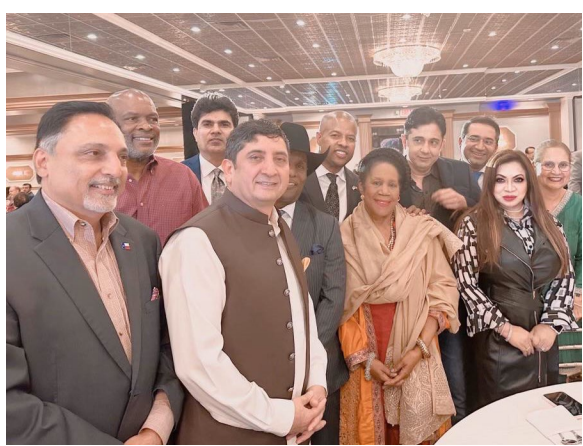
Nepalese Association of Houston Holi Celebration.